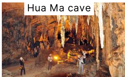
Hua Ma cave