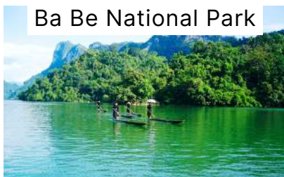
Ba Be National Park